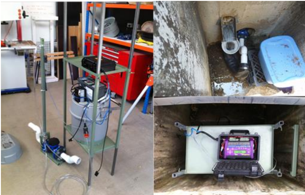
Figure 3 Flow monitoring and water sampling setup

diameter flow meters (Octave Ultrasonic Water Meter DN50) to measure flowrates (Figure 3). An ISCO GLS auto-sampler was used to collect outflow samples in each pit. Sampling equipment also included a Datalogger (DT80) datalogger, battery pack and battery charger. Flow-weighted water samples were taken by the autosamplers after every 50L of water had passed through the flowmeter. The water samples were collected through a tube connected to a tapping point on the underside of the flowmeter pipework. Composite water samples comprising were collected and analysed for the inflow and outflow results.