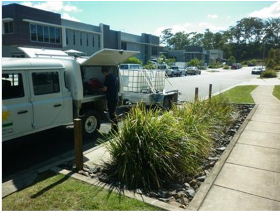
Figure 1 One of the three bioretention basins evaluated in the study

Bioretention systems (Figure 1) are generally soil-plant based systems that typically consist of a filter medium (usually sandy), underlain by a gravel drainage layer (Dietz, 2007; Deletic et al, 2014). Bioretention systems may be lined with some type of geofabric to allow infiltration, or include an impermeable liner to assist in stormwater capture and reuse (FAWB, 2009). Bioretention systems treat stormwater via a range of physical, chemical and biological processes. These include mechanical filtration, sedimentation, adsorption, and plant and microbial uptake (Deletic et al, 2014).