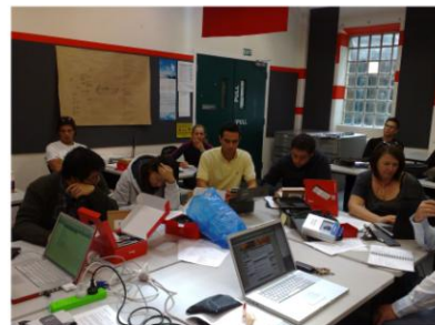
Fig 2. Students setting up their smartphones in a COP.

The core activity of the project is the creation and maintenance of a reflective Blog as part of a course group project. Additionally a variety of mobile friendly web2.0 tools are used in conjunction with the smartphone. The project investigates how the smartphone can be used to enhance almost any aspect of the course. To minimise the level of technological load and scaffolding required by the students (and lecturers) the project uses the smartphone within a select range of activities (see the following diagram and table that attempt to illustrate the alignment of these activities with the projects underlying social constructivist pedagogy. Students create accounts on free web2.0 sites and then invite their lecturer and peers to collaborate within these environments. The institutional LMS (Learning Management System) is used to provide scaffolding tutorials and initial guidance in setting up their web2.0 environments from the technology steward and the course lecturer. For a fuller description, there is an interactive online version of the project concept map available at: http://ltxserver.unitec.ac.nz/~thom/mobileweb2concept2.htm or mirror at http://homepage.mac.com/thom_cochrane/MobileWeb2/mobileweb2concept2.htm .