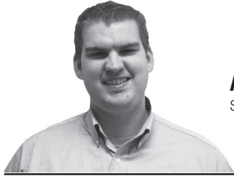
Alex Martinet STAFF WRITER

Like a novel, you can keep reading without stopping at an individual page