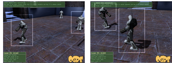
(b) Robots facing same direction (c) Robots facing opposite directions