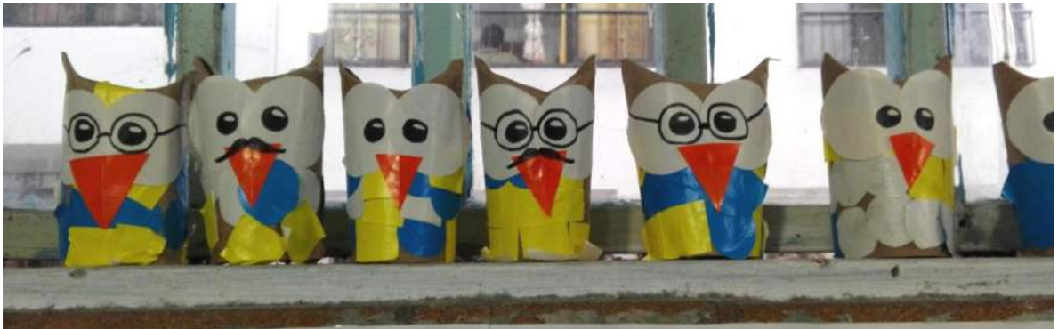
Students' owls with a toilet paper tube.