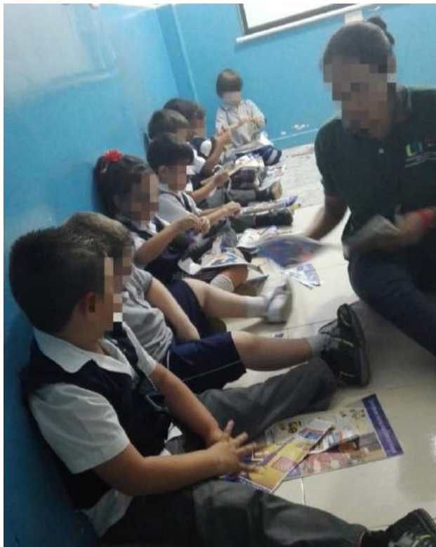
(Above) Pre service helping the students to get paper stripes to make a lion puppet with recycled materials. (Below) Students' portrait with their own jellyfish made of recycled materials.