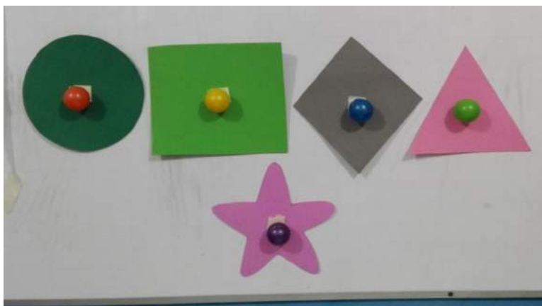
Coloring with a purpose. Each shape had a color.

The following pictures, there is the purpose of the activity and there are also the two samples selected in order to interpret language comprehension and to see if students were able to understand simple instructions and the learning of vocabulary proposed for that lesson: coloring with a purpose in shapes. (See appendix 6)