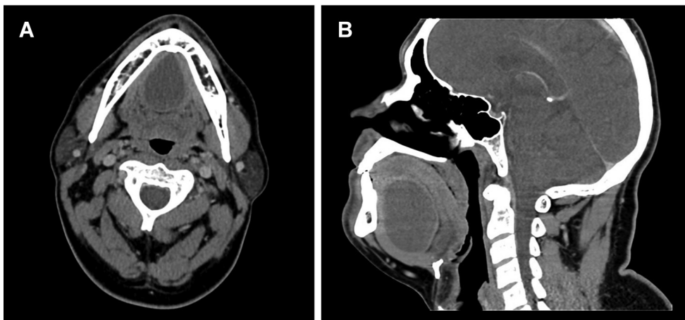
Fig. 1: CT scan showing a well-circumscribed lesion in the sublingual space. a) Axial view. b) Sagittal view.

In a review of 1,495 cases of dermoid cysts, New and Erich found only a 6.94 percent of DC involving the head and neck region and between them, the most common location corresponded to the lateral eyebrow, followed by the floor of the mouth in the 11 percent of the cases (1-3), as in the our patient. DC may occur at any