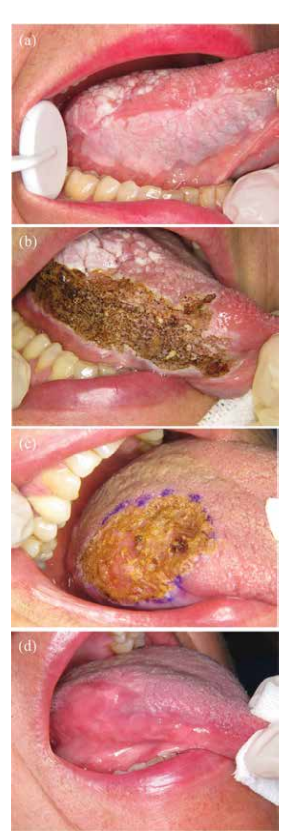
Fig. 2. (a) Non-homogeneous leukoplakia on the tongue mucosa of a 57-year-old female patient. (b-c) Treatment by CO2 laser vaporization. (d) Complete remission 1 year after laser vaporization.