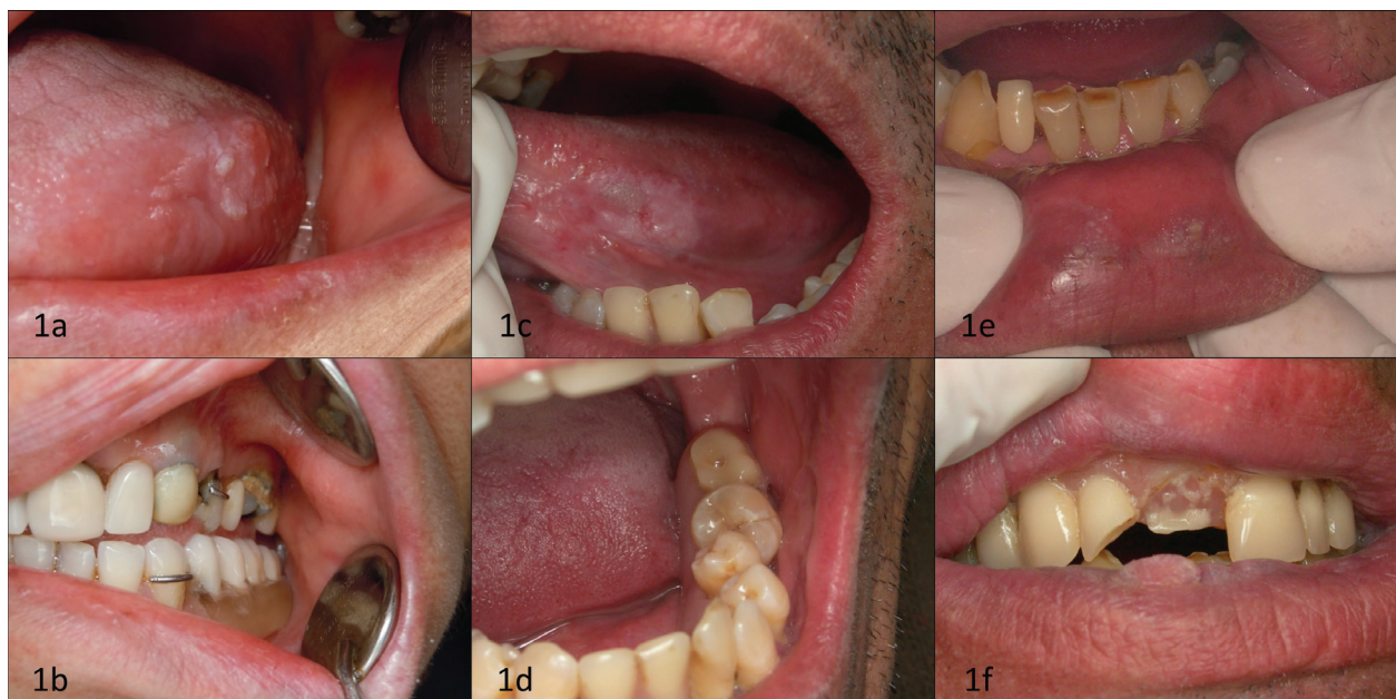
Fig. 1. Clinical cases of oral cancer associated to chronic mechanical irritation. a,b) Female (53 years old), non-drinker and non-smoker, presenting a squamous cell carcinoma on the border of the tongue. Given the inverted overbite, the bicuspid proclination and lack of canine guide, the patient involuntarily bite the area for more than three years. c,d) Male (44 years old), non-smoker, drinker of more than 350,000 gr of alcohol. Lateral tongue border presents a verrucous carcinoma. This area was in relation to CMI originated by the lingual position of lower premolars and molars and a defective partial removable denture, both in contact with the lesion for more than four years. e,f) Male (55 years old), smoker of more than 200,000 cigarettes and drinker of more than 600,000 gr of alcohol. The patient had a leukoplakia without dysplasia. A year later, an upper removable denture was broken, and since then a verrucous carcinoma began its growth in the injured site.

• Oral cancer in relation to the aforementioned traumatic factors that should be present before the patient awareness of the lesion (tumor or ulcer). This data was gathered through oral inspection and anamnesis, taking special caution regarding recall bias. Figure 1 shows clinical examples of CMI's associated carcinomas. Particularly 1c and 1d offers a good illustration of this point, where a verrucous carcinoma of left border and ventral surface of the tongue can be seen in contact with both teeth and removable dentures. Teeth are in a manifest malposition (particularly lower left 2 nd molar and 2 nd bicuspid). Although the patient could not remember with certainty when dental IMC started (originated be-