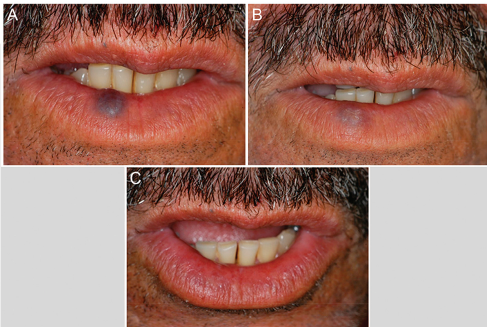
Fig. 2. Male patient, 56 years old with a congenital lesion in the lower lip. A. Clinical aspect in the first moment. B. After 1 application of EO. C. Complete regression of the lesion after 2 applications.