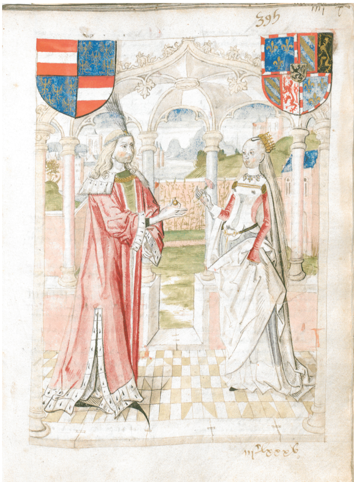
▲ Miniature depicting the marriage of Mary of Burgundy and Maximilian of Austria in the Excellent Chronicle of Flanders.