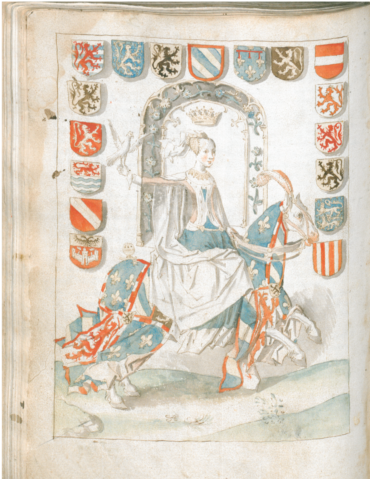
▲ Miniature depicting an equestrian portrait of Mary of Burgundy and the seventeen principalities of the Low Countries in the Excellent Chronicle of Flanders .