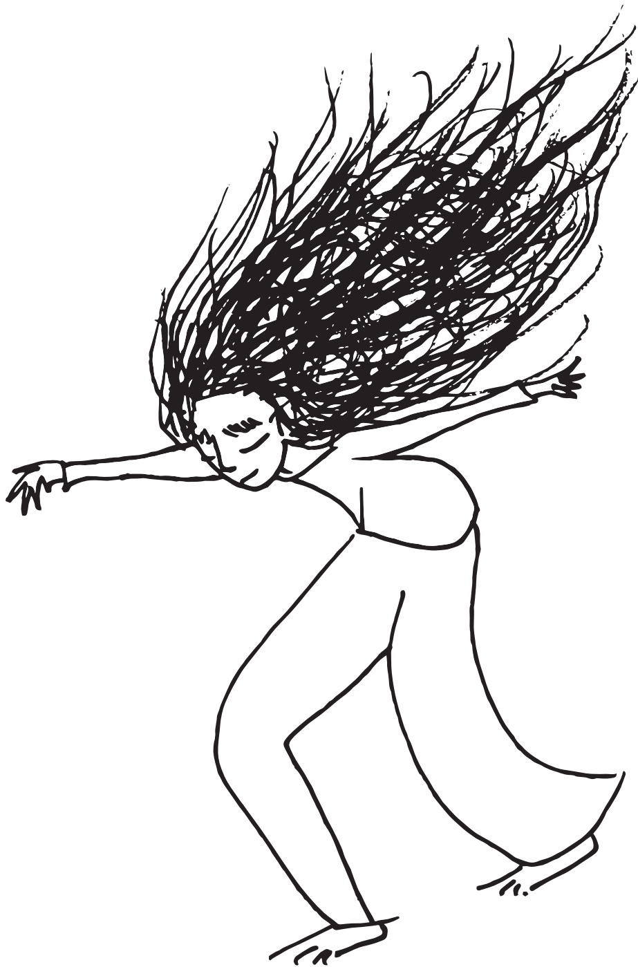
With Every Grain of Rice Theme 3: When Words Aren't Needed Ink on Paper (5 x 5 in.)