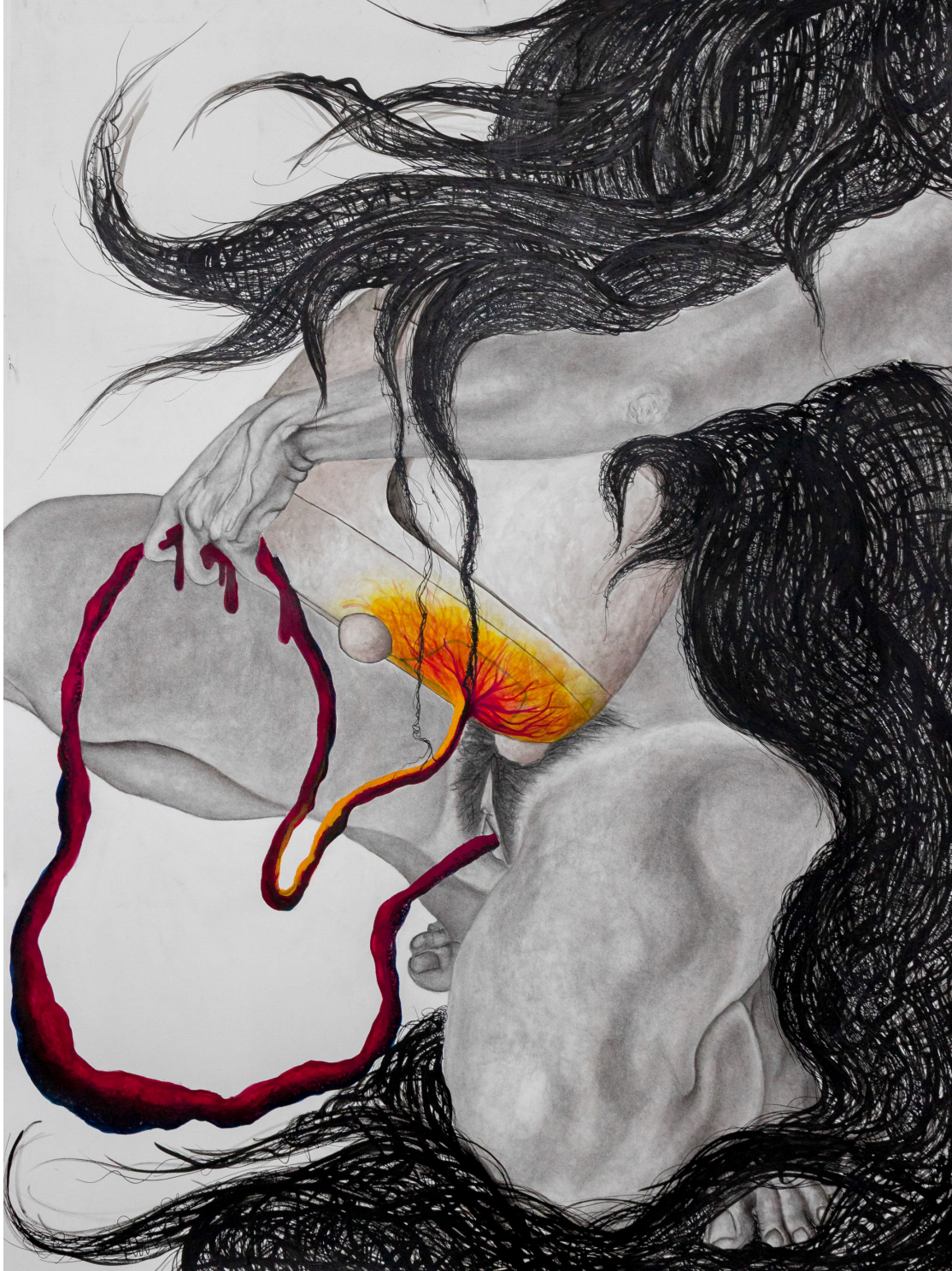
Uterus Plug-in Charcoal, Watercolor, Gouache, Ink on Paper ( 48.5 x 36.5 in. )