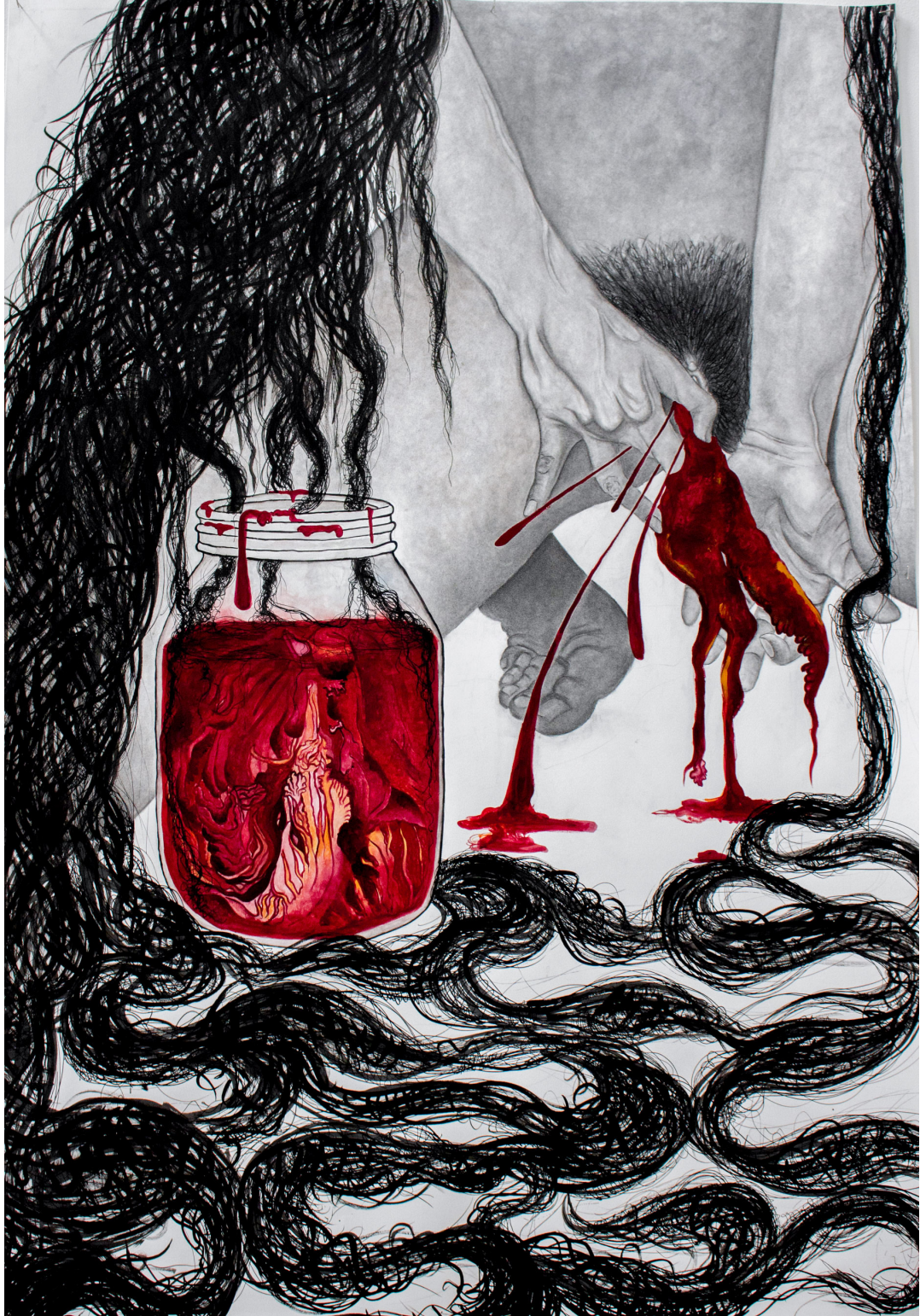
Kimchi Prenatal Regiment Charcoal, Watercolor, Ink on Paper ( 49 x 34 in. )