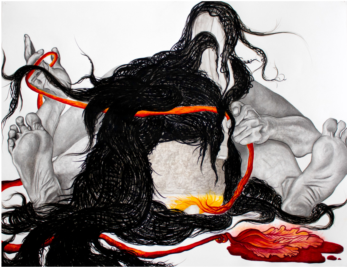
Rice Cooker Makeover Charcoal, Watercolor, Gouache, Ink on Paper ( 48.25 x 37 in. )