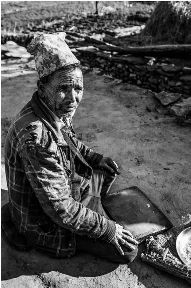
Figure 1. The divinatory practice of jotta herne , performed by the dhāmī .