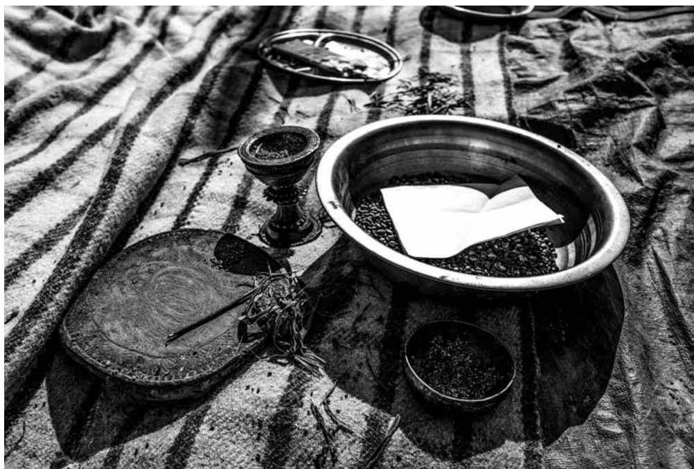
Figure 3. The wooden 'blackboard,' used to make the necessary calculations to forecast the influence of the planets.