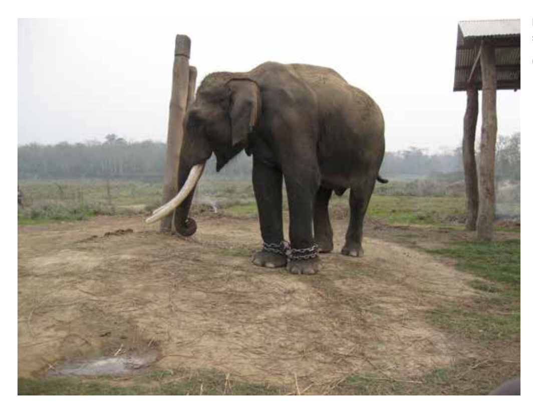
Figure 2. Gyanendra-Prasad, staked outside the shelter.