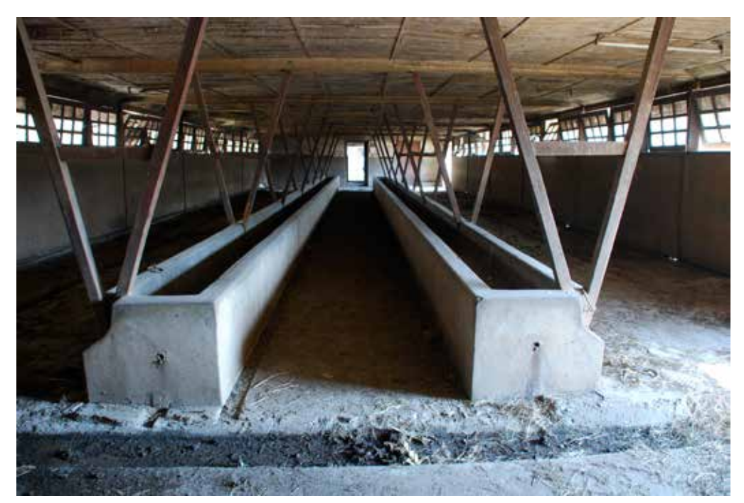
Figure 5. The abandoned cow barn at Narayanhiti Palace, about 3 years after the remnants of the former royal dairy herd were sent to auction.

The history of how the royal pheasants came to be housed at the royal bungalow in Nagarjun Forest is murky, because discontinuity in their care has led to significant loss of institutional memory. The national Ministry system rotates its staff members through different positions every few years, and so the current caretakers of the pheasants today are not the same people who were caring for them at the time of the interim transition, much less in the years preceding the transition. It is not even clear precisely who was caring for the birds during the kings' time, whether palace employees or national park staff, or someone else. Even if the birds' original caretakers were known and available, however, there is no guarantee that even those individuals would know exactly why or how the royal family acquired the pheasants: the monarchy's institutional procedures were often deliberately kept opaque to low-level staff, and so caretakers might well