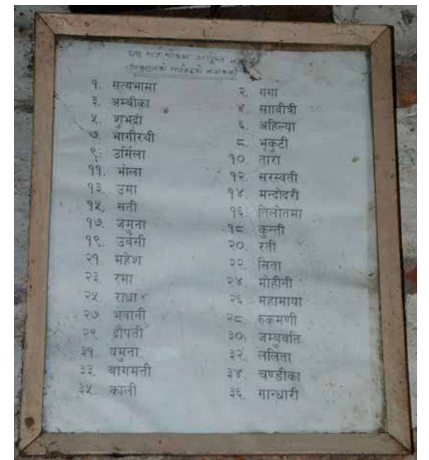
Figure 4. List of cow names as posted on Narayanhiti Palace barn wall.

With the milk transformed into a government asset, it would seem that the cows had demonstrated some utility to the secular parliamentary government, but their housing and care remained awkward and problematic. Upkeep costs outweighed the profit from the milk, and no one endorsed housing government cows on palace grounds. Eventually, the Ministry of Agriculture determined that the cows should be removed from