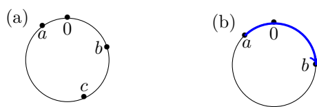
■ Figure 1 (a) Relation K . (b) The cyclic difference b \ominus a .

► Theorem 11. The fractional reachability relation of a fractional TPDA \mathcal{P} is expressed by existential \mathcal{L}_{\mathbb{Z}, \mathbb{Q}} formulas, computable in time exponential in the number of clocks and polynomial in the number of control locations and stack alphabet.