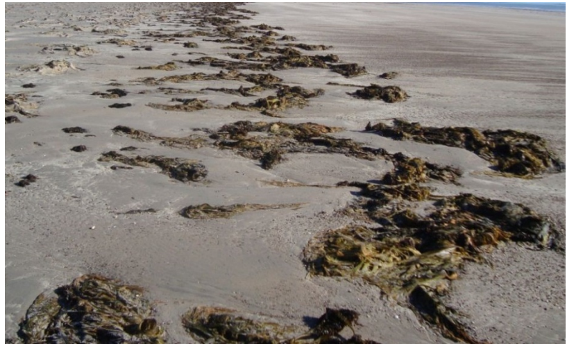
Figure 2. Beach wrack consisting of Undaria pinnatifida in Playas Doradas.