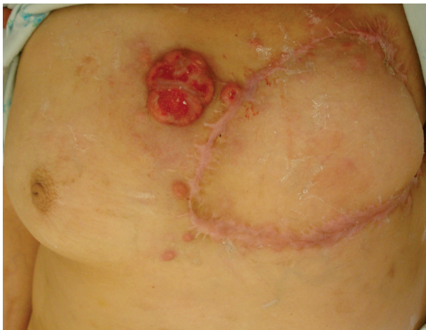
Figure 1 An ulcerated metastatic nodule on the chest region is observed. Note: Other metastatic lesions over the chest and reconstructed breast are also present.

Cutaneous metastases from breast carcinoma usually appear months to years after the diagnosis and treatment of the primary malignancy. 10,11 The most common localizations are in the chest wall and abdomen, but they can also be found in the scalp and extremities. 10 The clinical presentations vary over a wide range of different patterns. Nodules are the most common manifestation (80%), followed by telangiectatic carcinoma (11%), erysipeloid carcinoma (3%), “en cuirasse” carcinoma (3%), alopecia neoplastica (2%), and a zosteriform type (0.8%). 12 A diagnosis of cutaneous metastases is based on the clinical manifestations and the histopathologic study of the lesions.