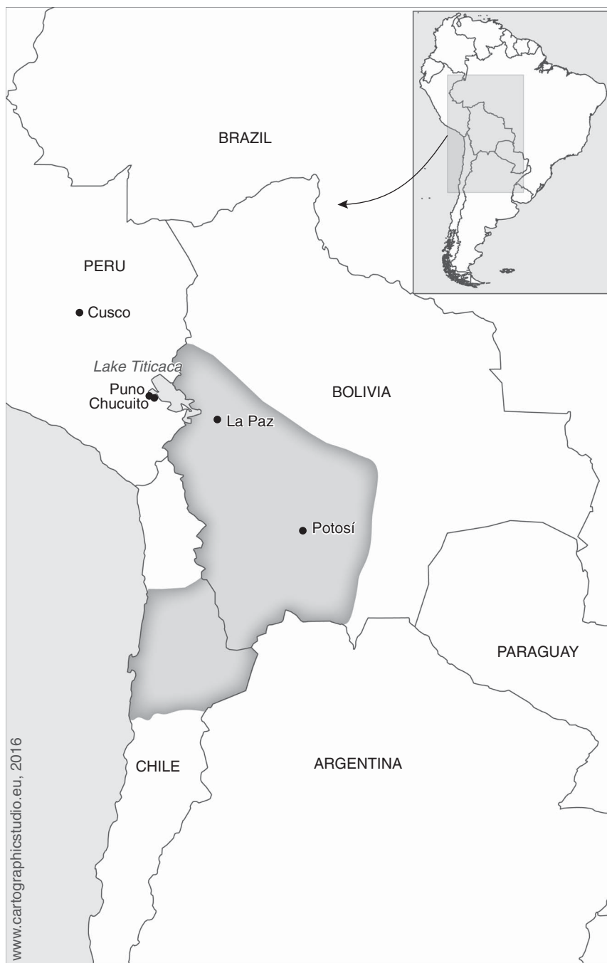
Figure 1. Charcas during the seventeenth century.