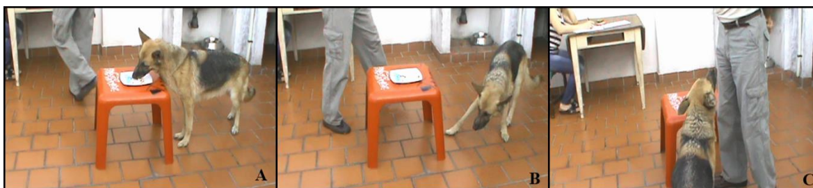
Figure 1. Image of the generated conflict. (A) The dog is taking the human food from the plate. (B) The target owner (O1) is scolding the dog. (C) The owner remains looking fixedly at the dog during 30 s after the scolding.

During testing there were two owners present, as well as a female experimenter who filmed the dogs' behavior. We also place a steady camera on a tripod to capture the whole situation. Both cameras were SONY DCR 308 and dogs behaviors were analyzed afterwards from the videos collected (see Data Analysis).