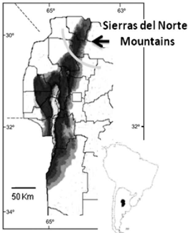
Fig. 1. Location of the Sierras del Norte Mountains in Córdoba province (Argentina). Sample sites were evenly distributed across the region.

We sampled 55 sites covering the entire altitudinal gradient of the Sierras del Norte Mountains. The sites were also evenly distributed