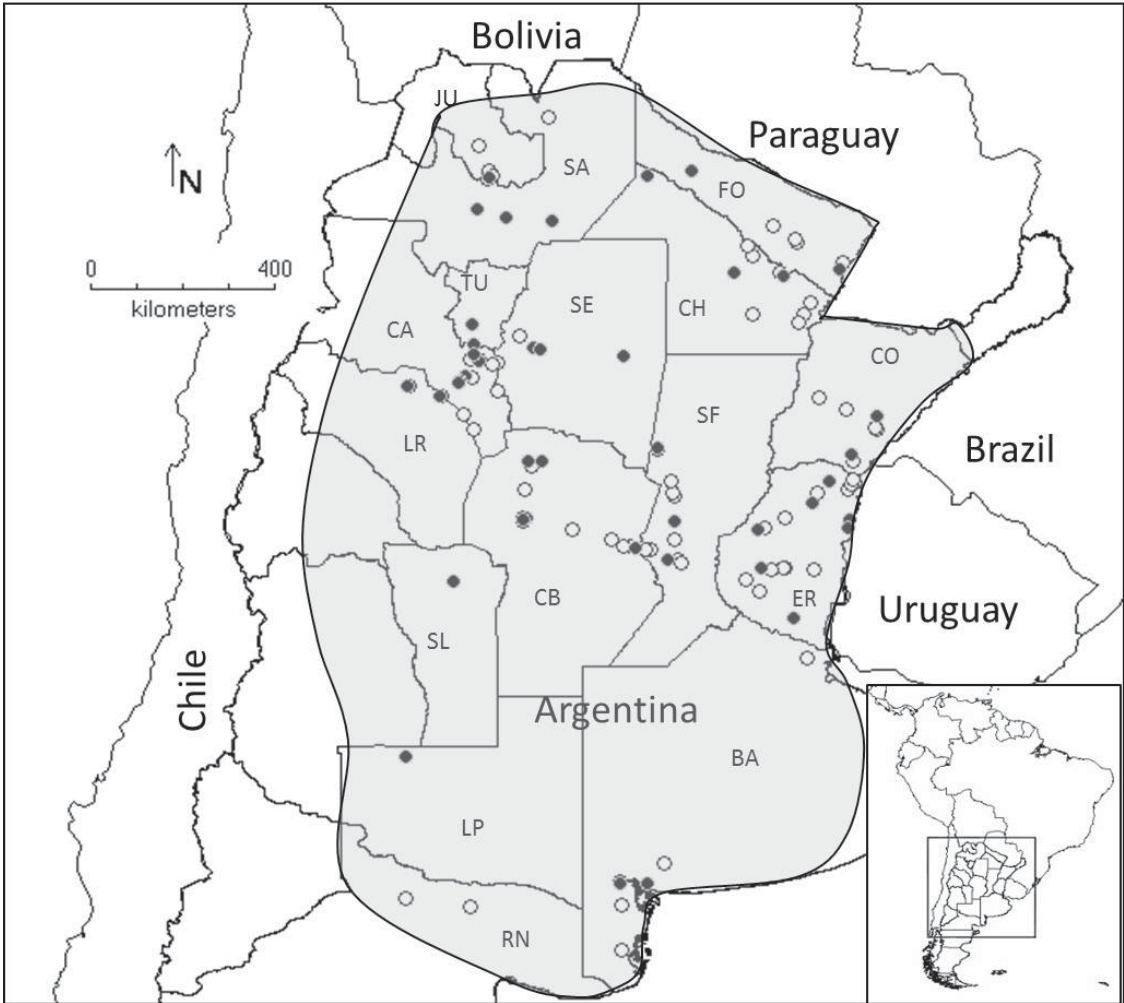
Fig. 2. Distribution of Apanteles opuntiarum which emerged from Cactoblastis cactorum larvae (black circles) and locations where A. opuntiarum did not emerge from C. cactorum larvae (white circles) collected in the Argentina provinces of Buenos Aires (BA), Catamarca (CA), Córdoba (CB), Chaco (CH), Corrientes (CO), Entre Ríos (ER), Formosa (FO), Jujuy (JU), La Pampa (LP), La Rioja (LR), Río Negro (RN), Salta (SA), Santiago del Estero (SE), Santa Fe (SF), San Luis (SL), and Tucumán (TU). Shaded area indicates surveyed region.

conditions, such as host and parasitoid densities, and source of the females. The highest success was obtained with 30 host larvae exposed to parasitism by two field-collected female wasps. Increasing host larval numbers ( n = 50 ) did not translate into higher reproductive success, and decreasing host larval numbers ( n = 10 ) negatively impacted the reproductive success of A. opuntiarum . At this lowest density, many host larvae died in earliest instar stages, probably because of superparasitism or numerous stings. Although field-collected females had a similar attack rate as laboratory-reared females, the former produced a greater number of offspring and produced both males and females, essential to the continuity of a laboratory culture.