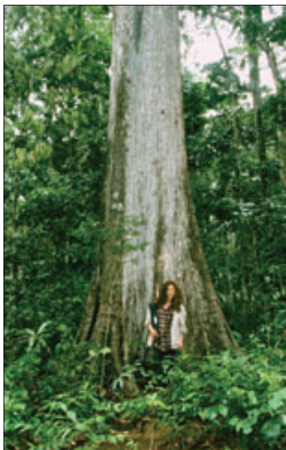
Fig. 2: Cedrela odorata tree growing at Pando, Bolivia (11°S 200m a.s.l.) in the southwestern part of the Amazon basin. The climate presents a mean annual temperature of 27°C and 1800 mm of precipitation with a marked dry period during the months of May to September. The diameters of the dominant trees reach 1.0 – 1.5 meters.

Reconstruction of low latitude climate variability has been hampered by the lack of suitable annually resolved proxy climate records. Several factors can be invoked to explain the unbalanced distribution of tree-ring records between tropical and temperate regions in the Americas. Most tropical species do not form distinct rings and when rings are present, they are not annual. Some species show clearly visible rings but the circular uniformity is uncertain. Absence of seasonality appears to be the main reason for the lack of well-defined boundary rings in the tropics. Nevertheless, there are tropical and subtropical regions that experience seasonal changes in precipitation or temperature that can induce the formation of defined growth rings. In order to fill the “tropical gap” between the presently available