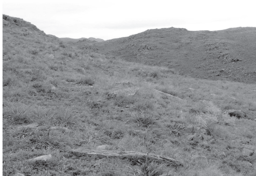
Fig. 2. Typical grassland slope in the “Ernesto Tornquist” Provincial Park where the array of pitfall traps was located.

Spider collection: Spiders were sampled bimonthly using pitfall traps between September 2009-2010 (first year), and March 2011-2012 (second year). A total of 10 traps were placed every 10m along a transect of 100m parallel to the longest axis of a grassland slope with native vegetation (Fig. 2). Pitfall traps consisted of cylindrical plastic recipients of 23cm in diameter and 15cm high buried and covered with a plastic roof sustained by three metallic rods at 15cm from the soil. They were filled with 1 500mL of ethylene glycol, which prevented evaporation and acted as a preservative. All traps were examined and refilled every 60 days period. Voucher specimens were deposited in the arachnological collection of the Laboratorio de Zoología de Invertebrados