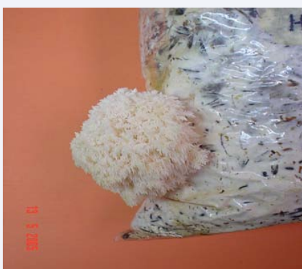
Figure 7 Hericium erinaceus grown on sunflower seed hull substrate.

BE (37.4%) and P (0.7% day -1 ) values, constituting a very good basal substrate, so this substrate by itself can be considered a very good source of energy and nutrition for H. erinaceus growth and development.