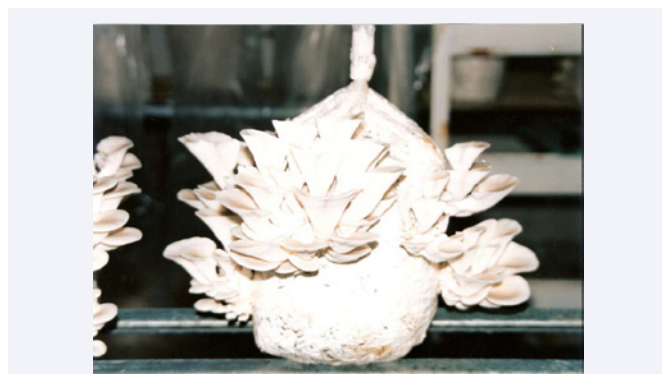
Figure 3 First flush of P. ostreatus on sunflower seed hull based substrate.

(0, 200, 500 or 750 ppm) [15]. Results showed that BE increased over control values and reached 60-112%, depending on the strain and the concentration of Mn (II) and \text{NH}_4^+ .