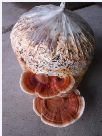
Figure 5 Ganoderma lucidum carpophores grown on sunflower seed hulls.

mushroom solid fermentation. It could be observed that inclusion of sunflower seed broth (65 g.L -1 seeds) in the formulation of a liquid culture for G. lucidum and G. oregonense could markedly improve mycelium and polysaccharide production [33]. Furthermore, one-gram Ganoderma lucidum dried mycelium grown in that liquid medium in the presence of 50 mg kg -1 Cu or Zn showed a bioavailability of 19% Cu and 2% Zn of the recommended daily intake (RDI) for humans, using an in vitro simulated digestion system [34]. This study also reported that when reishi carpophores from SSH substrate were evaluated, the highest BE (23.2%) was reached when the substrate was enriched with 100 mg kg -1 Cu and that time to crop fruiting was markedly reduced in the case of the substrate enriched with 50 mg kg -1 Cu. However, Cu and Zn content obtained either before or after carpophores digestion from all metal enriched treatments, were substantially lower than those from metal enriched mycelia. The metal bioavailability was also low: 1.5% of the Cu RDI and almost negligible for Zn.