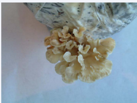
Figure 6 Grifola sordulenta carpophores grown on sunflower seed hulls substrate.