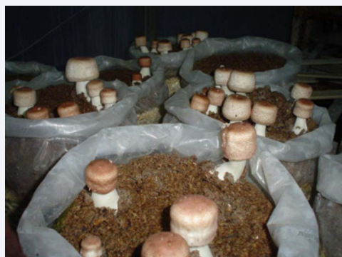
Figure 10 Agaricus brasiliensis on non-composted substrates containing SSH with an equal part of P. pulmonarius spent substrate.

Agaricus brasiliensis laccase production obtained either in composted or non-composted SSH and wheat straw was studied in order to evaluate the remaining substrates as a potential source for the extraction of high valued ligninolytic enzymes like laccases [46]. Cu solutions incorporation (100 or 200 ppm) on top of the casing layer (composted substrate) or as part of the formula (non-composted substrate) stimulated laccase production. Only the addition of 100 ppm Zn had a positive effect on lac cases and mainly in composted substrates.