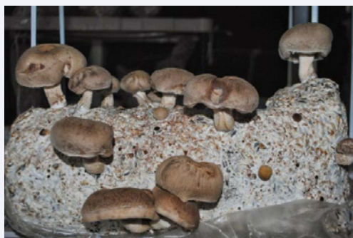
Figure 4 Shiitake mushroom first flush on a sunflower seed hull substrate.

The utilization of sunflower seed (SS) is not restrained to