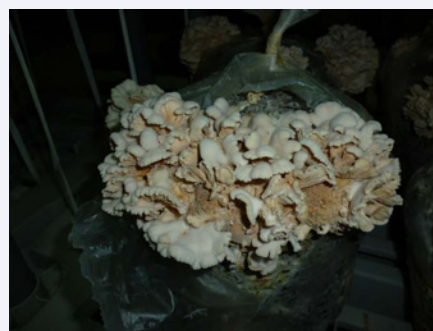
Figure 8 Schizophyllum commune on SSH based substrate and wheat bran (7.5%).

Cultivation of A. brasiliensis on axenic substrates was studied. Substrate formula consisted in SSH, P. pulmonarius spent substrate, or their combination, in the absence or presence of different supplements (vermicompost, peat or brewery residues). Yields results were similar to composted substrates [45] (Figure 10). The lignin-hemi cellulose fraction was preferentially used as it was shown by substrate changes composition measured at the end of two flushes.