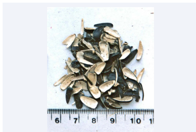
Figure 2 Sunflower seed hulls as emerge from oil industry.