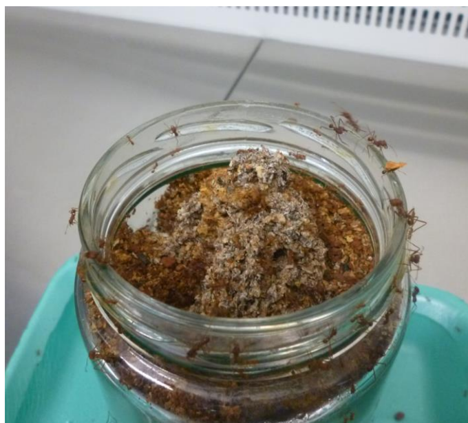
Fig. 1- Leucoagaricus gongylophorus grown in a fungal garden of leaf-cutting ants

leaf-cutting ants control (Lopez & Orduz 2003). Consequently, there is need for new and alternative control methods that can provide more sustainable and efficient control of leaf-cutting ant colonies (Folgarait et al. 2011, Napal et al. 2015). Alternatives to chemical insecticides are being researched and developed (Lopez & Orduz 2003, Folgarait 2013). Consequently application of chemical insecticides is being replaced or complemented by biocontrol agents because of the emergence of insecticide-resistant populations and public concerns regarding the health and environmental impacts of these chemicals.