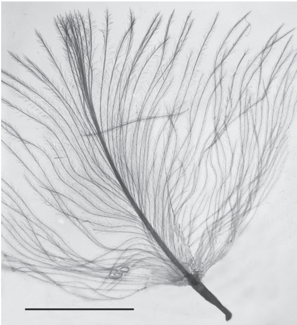
FIGURE 1. Tuft feather of the uropygial gland of an Adelie penguin ( Pygoscelis adeliae ). Photograph taken with a Summar 80 mm objective, scale 10 mm.

Regarding the length ratio between calamus/raquis (Table 1), it was greater in terrestrial species ( 0.43 \pm 0.14 vs. 0.20 \pm 0.07 ; p < 0.0001 ).