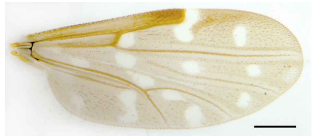
Fig. 4: Culicoides lisicarruni sp. n. wing, dorsal view. Bar = 0.25 mm.

while the minimum between -2°C-0°C. The dry season extends from November-March and the rainy one from April-October. C. lisicarruni shows two peaks of activity, one in the daybreak from 06:00-08:00 am and the other during the dusk from 05:00-06:00 pm. Some specimens were observed on a stone as a resting place near the stream where the specimens were collected. Species density was higher during the rainy season.