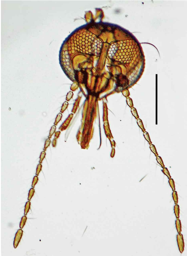
Fig. 1: Culicoides lisicarruni sp. n. head, dorsal view. Bar = 0,1 mm.

CuA 1 , posterior one very narrowly separated from wing margin; anal cell with two distal pale spots, basal indistinct pale area. Macrotrichia spread on distal 2/3, extending also to base of anal cell. Halter pale brown.