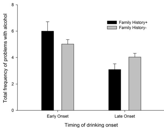
Fig. 1. Total frequency of problems with alcohol as a function of timing of drinking onset [early onset (first drinking by the age of 15 or younger) or late onset (first drinking by the age of 16 or older)] and positive or negative family history of alcohol abuse. Vertical bars indicate the standard error of the means.

Monthly number of alcohol intoxication episodes in FH- subjects was similar whether they had begun drinking early or late, U = 8648.5, P > 0.05. Time of drinking onset, on the other hand, significantly affected FH+ subjects. In the latter group, early drinkers had significantly more monthly alcohol intoxication episodes than late drinkers, U = 577.5, P < 0.05 (Fig. 2).