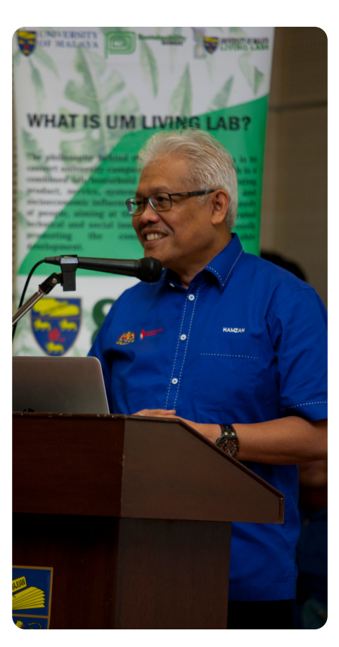
YB Dato' Seri Hamzah Zainudin, Minister of Domestic Trade, Co-operatives & Consumerism (KPDNKK) delivered his opening address

Sustainability Science Research Cluster ss_cluster@um.edu.my +603 - 7967 7807