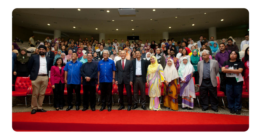
Official Group Photo of SCORE2018 with YB Dato' Seri Hamzah Zainudin, Minister of Domestic Trade, Cooperatives & Consumerism (KPDNKK)