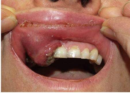
FIGURE 1: Preoperative intraoral view of the lesion.