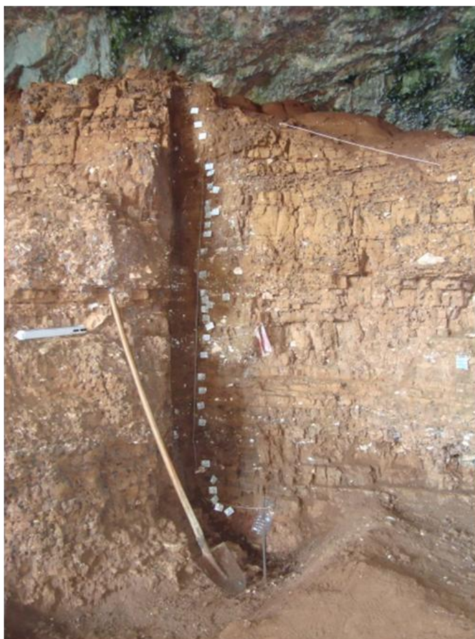
Fig. 2 - Picture of stratigraphic section SS1.

Laboratory analyses confirmed that the grain size distribution is generally bimodal, with elevated percentages in clay (from 27 to 59%, mean 47%) and silt (from 26 to 54%, mean 44%) grain size fractions; in several samples the sand fractions are also detected. Variations in these proxies along the sedimentary sequence are