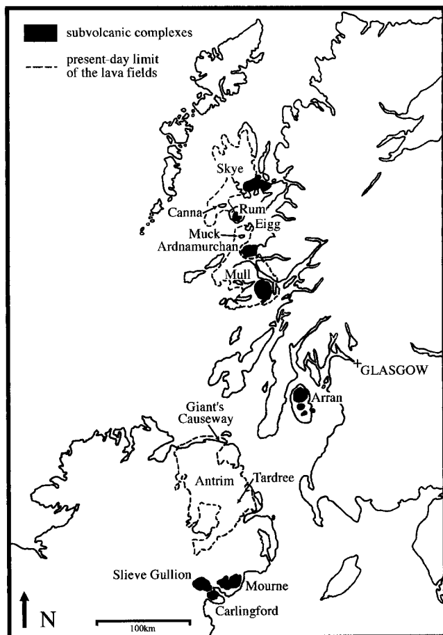
Fig. 1. Location map of the present-day limits of the lava fields and subvolcanic complexes of the British Province.

spatially-associated subvolcanic complexes of the British Province. Figure 2 is a summary of the stratigraphy of the British Province lava fields.