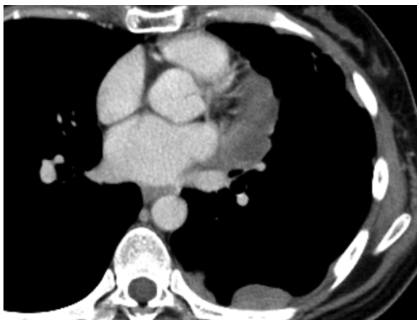
Figure 1. The preoperative chest computed tomography (CT). The CT image shows disseminated nodules in the left pleural cavity. We detected tumours that were adjacent to the pericardium, which indicated the possibility of pericardium invasion.