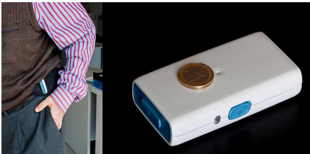
Figure 1. Inertial sensor.