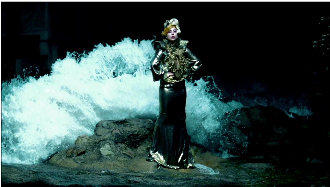
Screen shot of Lady Gaga's Judas 5

flutter or hiss that could be wind blowing into a microphone. One could contemplate the presence of a microphone, removing us from the immediacy of this soundscape by reminding us of our observer status. Alternatively, a listener might simply remain uncertain about the origin of this sound. Composers of electro-acoustic music have long recognised the tension and interplay between the directness and near-tactility of every-day sounds and other sounds that are less easily recognised and afforded with an unsettling sense of ambiguity about their source. What makes this and similar passages of music and sound art so robust, visceral and at the same time intriguing is therefore not their symbolic import or saturation, but precisely the absence of the Symbolic, the lack of culturally specific signifiers that open a gap for the Real to emerge. However, the images and sounds of Lady Gaga's Judas , once this music video is considered as a whole, appear to be caught up in all three interlocking rings of the Real, the Symbolic and the Imaginary.