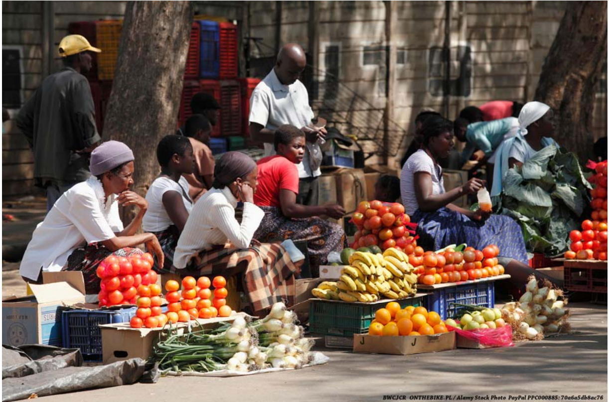
Figure 1: Street vendors (hawkers) in Bulawayo

The combined exposure to high temperatures, humidity and radiant heat from direct sunlight, as well as the lack of ready access to potable water, means that this sector of the population are at a much greater risk of suffering the effects of heat stress and its related illnesses which can cause death and other chronic conditions such as renal disease. Heat stress can also exacerbate other underlying conditions (Coco et al., 2016). In this article, susceptibility is described as the state of vulnerability of a group of people (street hawkers) who are exposed to the impacts of climate change. Street hawkers in developing countries are particularly vulnerable as they have less capacity to adapt and there are no heat wave health-related policies that would apply to them (Frimpong et al., 2015).