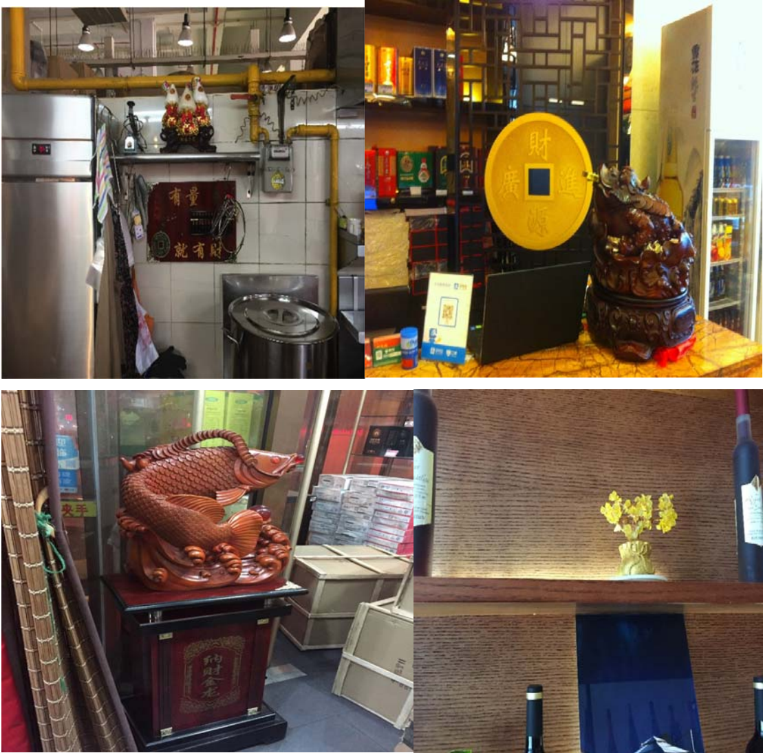
Figure 1. Pictures from top left to right. Salt mountain with abacus below; money toad with coin; Golden Arowana; yellow calcite wealth tree.

Yes, the abacus, that abacus means if you look at it in Asian days it is about doing the maths, counting the money. So with the abacus on there, it means that there will be money coming. ... it symbolises endless calculation, endless adding, endless whatever. Because it means that money is coming in and I am counting the money every day so on and so forth, endlessly. (Female, Singapore)