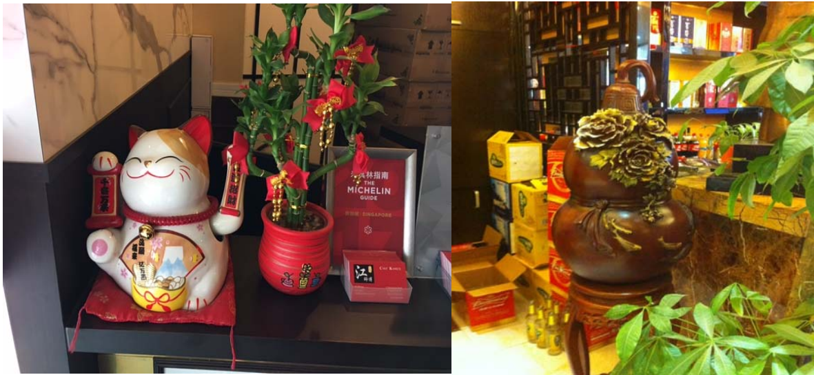
Figure 2. Pictures left to right. Waving fortune cat; gourd carved with peony and carp.

Another common theme evident from the artefacts was protection. Statues of Guan Gong (God of War) to symbolise courage, integrity and wealth, and Fu Dogs to guard and protect against bad luck were found in and outside restaurants. Similarly, statues of the magical Chi Lin (the Chinese Unicorn) were used to attract good fortune and evade bad luck.