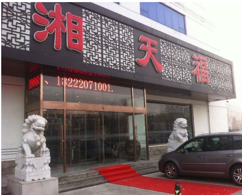
Fig 3. Fu dogs guarding restaurant entrance.

Another common theme evident from the artefacts was protection. Statues of Guan Gong (God of War) to symbolise courage, integrity and wealth, and Fu Dogs to guard and protect against bad luck were found in and outside restaurants. Similarly, statues of the magical Chi Lin (the Chinese Unicorn) were used to attract good fortune and evade bad luck.