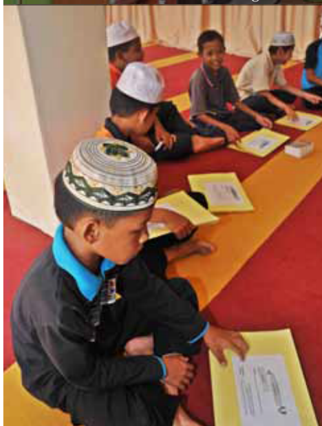
The kids were getting ready for the reading class.

22 May 2010. CMLHS extended its remarkable contribution to the society by organising a Let's Read (Jom Membaca) programme which had taken place at Permata Camar Orphanage (CAMAR), Sungai Soi, Kuantan.