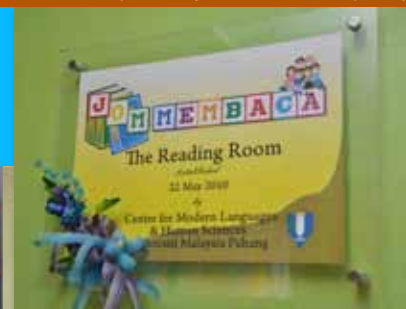
A cheerful Reading Room set up for Permata Camar Orphanage.