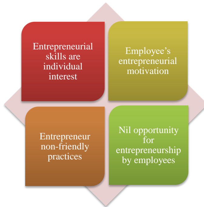
Figure 2: The themes emerge from the findings of the study

In discussing the first theme, entrepreneurial skills are individual interest, Employer 7 argued that the interest to involve in entrepreneurship rest on the graduates themselves. He asserted: “If you were to ask about entrepreneurial skills of the Islamic college graduates, I believe that involving in the field is up to themselves” . He added that entrepreneurial skills were added values viewing that the nature of the organisation in which the graduate was employed did not require such skills. He said, “... having entrepreneurial skills may add value to your ability in doing your jobs. But here, as a religious officer, honesty, sincerity is more important [than the skills]” . Nevertheless, he admitted that they were employees in other departments that were involved in business. He claimed, “... there are three to four personnels in that department [pointing to other departments in the organization] involve in business. For instance, they are some of them who sell prepaid top-up, clothes, and a lot more.