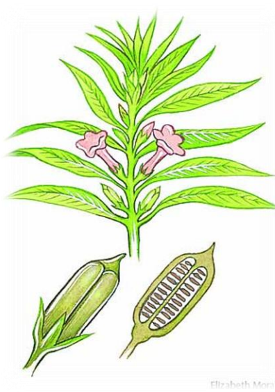
Figure 1.1: The plant of sesame

Sesame ( Sesamum Indicum L. ) is an important oilseed crop in the world. It is also known as benniseed (Africa), benne (Southern United States), gingelly (India), sim-sim (Hebrew) and tila (Sanskrit). The seed is a member of the Pedaliaceae family , which is family of a flowering plant. Sesame seed generally were originated found in Africa and the Middle East, because both species are similar. Then, the seeds were brought to India, Burma, China, Japan and Unites States along the late seventeenth century. Until today, sesame seed was found in every country and it has become an annual plant production (Hwang, 2005). Sesame seed grows in the tropical and subtropical area. It is commonly known as cultivated species, which depending on the variety varies in height and conditions. It has a large taproot and a diverse surface mat of feeder roots, which makes it resistant to drought. Figure 1 shown the plant of sesame, the stems have branches and densely hairy. The leaves also are hairs on the both sides and also highly variable in shape and size. The lower leaves are dull green in color, 3-17.5 cm long and 1-7 cm wide, while the upper leaves is 1-2 cm long. Sesame has large, white and bell-