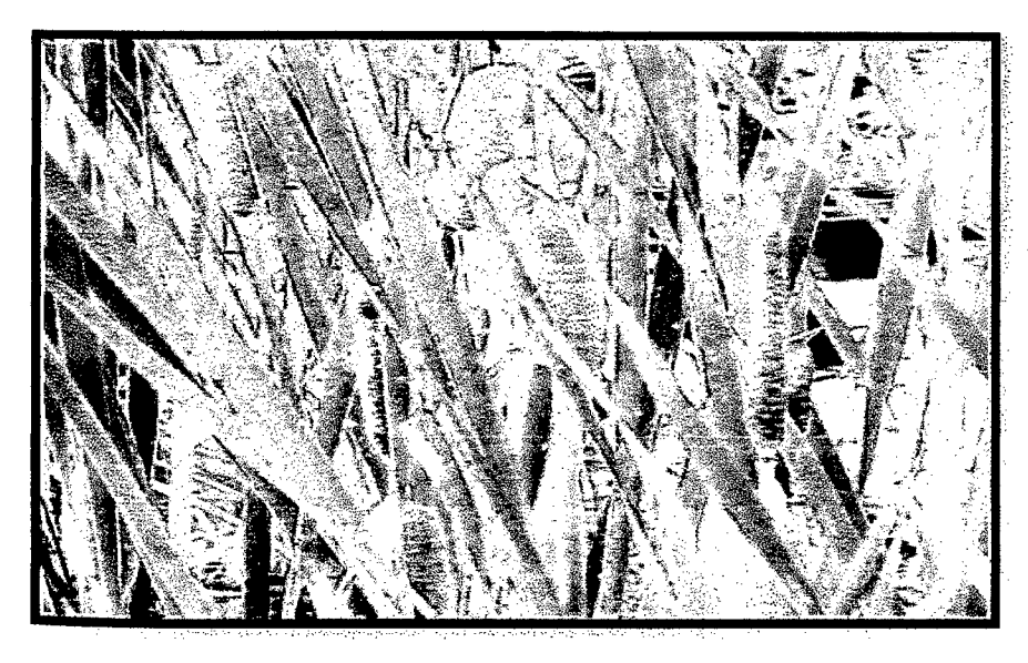
Figure 2.3: Cattails

Cattails are ubiquitous in distribution, hardy, capable of thriving under diverse environmental conditions, and easy to propagate and thus represent an ideal plant species for constructed wetlands. They are also capable of producing a large annual biomass and provide a small potential for N and P removal, when harvesting is practiced. Cattail rhizomes planted at approximately 1 m (3.3-ft) intervals can produce a dense stand within three months (Miller, I.W.G., and S. Black.).