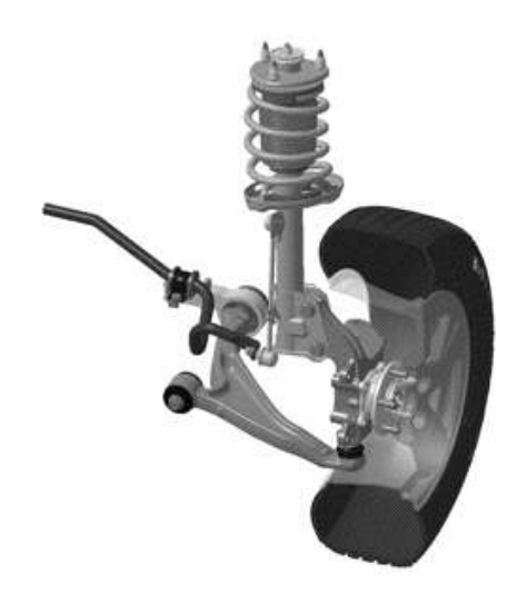
Figure 2.1: MacPherson strut suspension