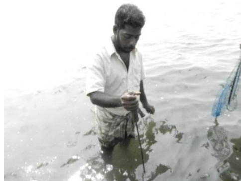
Fig. 3. Use of crab piercer by fishermen