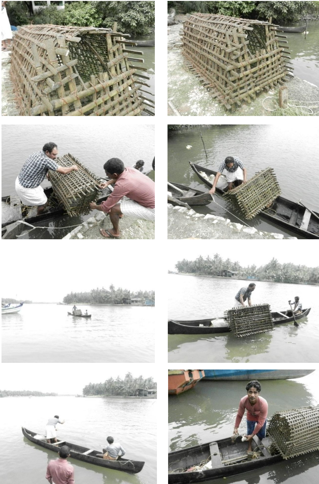
Fig. 1. The structure of “ChemballiKoodu” (Box Trap)