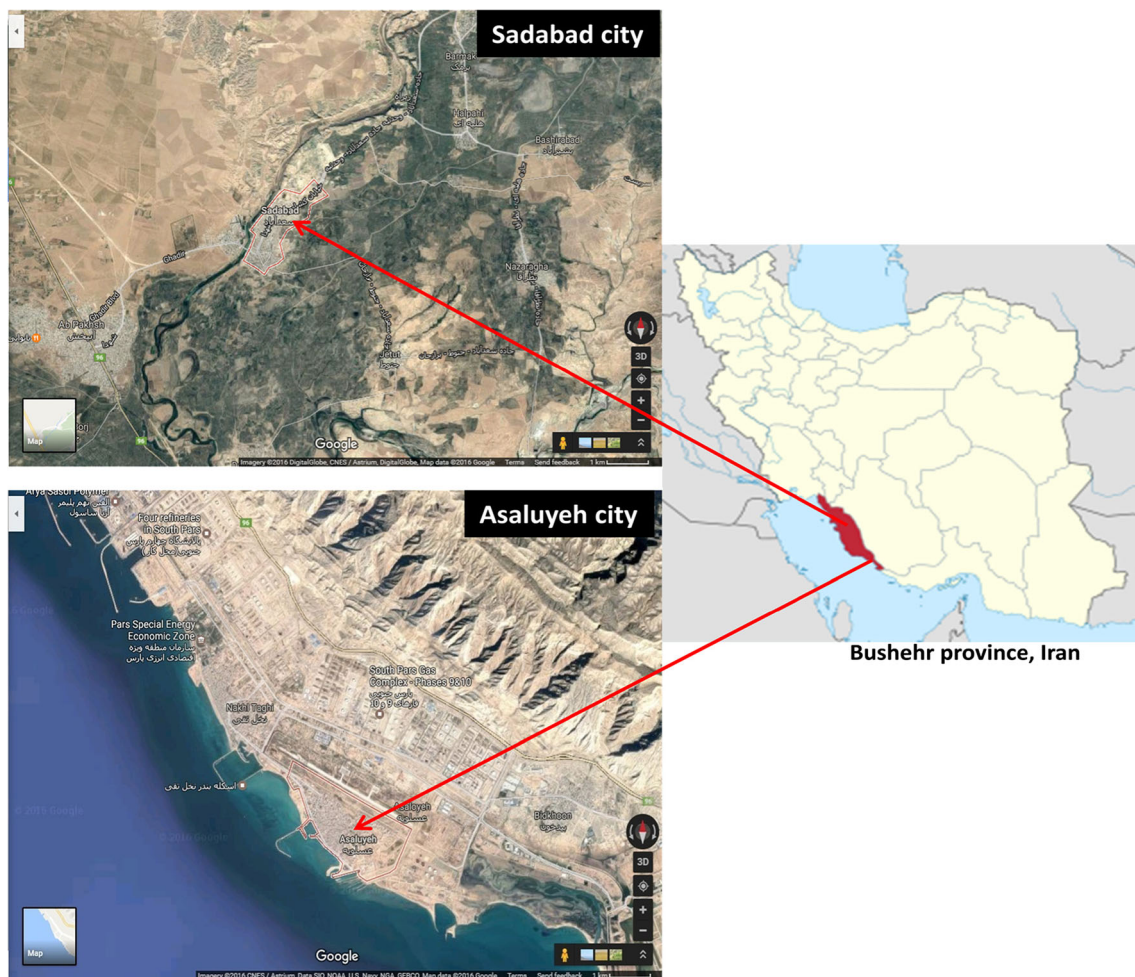
Fig. 1 Location of Asaluyeh area with industrial companies in surrounding and Sadabad City in Bushehr Province, Iran

Asaluyeh City has a low surface area, the distance between exposed children resident and the suspected sources of pollution was about 2–7.5 km.