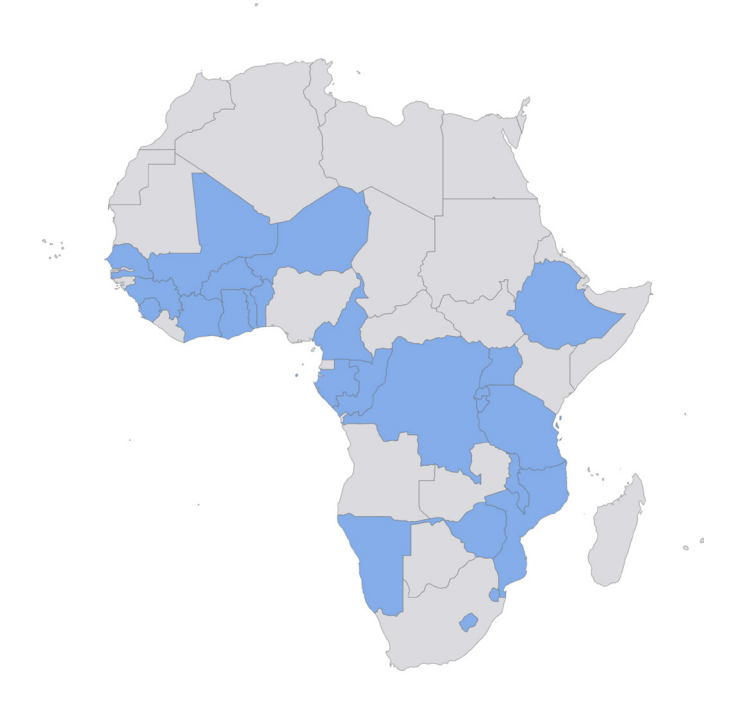
Figure 1 Map of 27 sub-Saharan African countries included in analysis.

We included data from children age 6–59 months in the 27 SSA countries participating in the DHS that performed anaemia testing (see figures 1 and 2). We analysed the Children's Recode using data from the most recent surveys available (2008–2014). In most cases, we used data from DHS-VI; for Ghana we used data from DHS-VII; for Sao Tome and Principe and Swaziland we used data from DHS-V. Madagascar was excluded from the analysis because of missing data on children's weight.