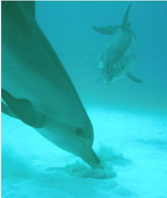
Figure 1. A spotless two-tone calf digs in the sand for fish while being watched by an elder dolphin.

A play-forage juvenile subgroup was defined as a group of three to five juveniles that display foraging behavior while socially interacting and swimming together at the bottom of the sea. The relative age of the juveniles in each group is visibly distinguishable via skin pigmentation and/or body size in cases where individual identification was unavailable. A benthic foraging sequence in juvenile subgroup was defined as the period between the start and the end of a benthic-feeding event in subgroup. The sequence starts when an individual initiates scan, dig or chase. The sequence ends when one of the following cases occurred: fish chase is over because fish escapes or is ingested, subgroup dissolves or subgroup leaves benthic area. The videos ( n = 8 ) were selected for the presence of foraging juveniles and were included in the analysis as long as the focal juveniles did not go out of the video for more than three seconds in play-forage subgroups.