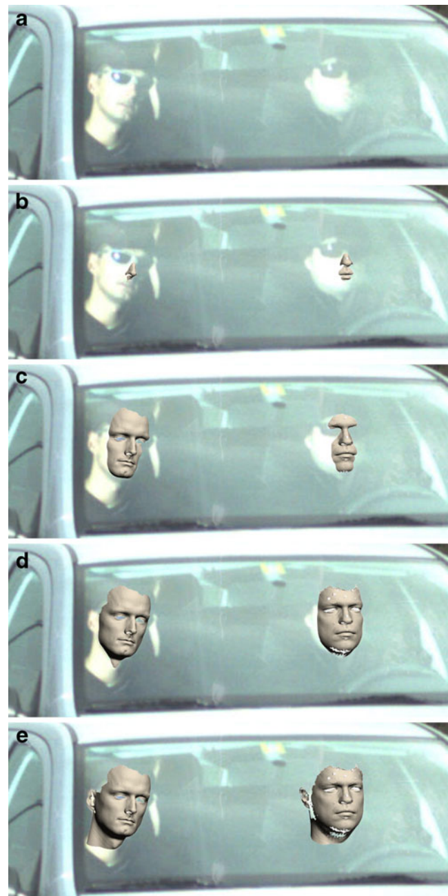
Fig. 1 Comparison of the driver and front-seat passenger of the Skoda Fabia with the corresponding suspects. Parts of the 3D model of the driver's and front-seat passenger's face are inserted step-by-step into the speed-check photograph. a The speed-check photograph. b The nose and parts of the mouth of the corresponding suspects are visible. c Comparison of the whole mouth and the brow. d Comparison of the cheeks and eyes. e Visualization of the ears

Another possibility for comparison is to move the 3D model of the face step-by-step into the speed-check photograph (Fig. 1). First, the nose and parts of the mouth are visible. Then the whole mouth and the brow, in the next step the, cheek and eyes, and at last the ears. In this way,