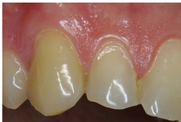
Fig. 1 Facial erosion: The intact enamel border along the gingival margin of tooth 12 and some plaque remnants are clearly visible. Note the smooth silky-glazed appearance and the absence of perikymata on the enamel surface

The clinical examination should be done systematically using a simple but accurate index. This is a difficult task to achieve as an index with a too-fine grading shows a small inter- and intraexaminer reliability [60]. For a dental practitioner, the most important part is to recognize the condition and to describe its dimension and severity. It is important to search for a general pattern and not to overinterpret one single sign. For epidemiological purpose, an