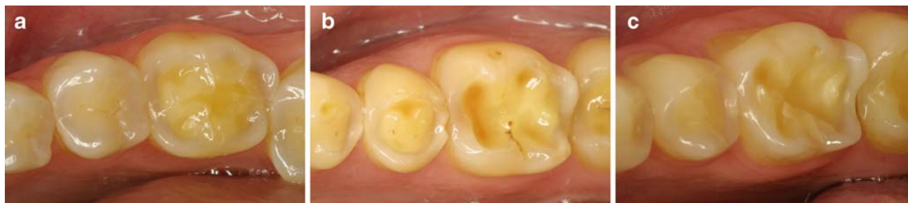
Fig. 4 a–c Typical pattern of advanced occlusal erosion of teeth 45 and 46 of three different patients: The whole occlusal morphology disappears, and extensive exposed dentinal areas are visible

Acids such as citric acid exist in water as a mixture of hydrogen ions, acid anions (e.g. citrate) and undissociated acid molecules, with the amounts of each determined by the acid-dissociation constant and the pH of the solution. The hydrogen ion directly attacks the crystal surface. Over and above the effect of the hydrogen ion, the citrate anion may complex with calcium, also removing it from the crystal surface. Each acid anion has a different strength of calcium complexation dependent on the structure of the molecule and how easily it can attract the calcium ion [28]. Consequently, acids such as citric acids have double actions