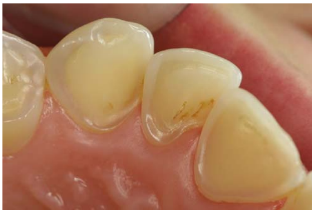
Fig. 3 Erosion with involvement of dentine on the oral surface of tooth 13, 12 and 11. Intact enamel borders along the gingival margin