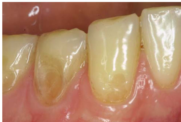
Fig. 2 Advanced facial erosion of teeth 43, 44 and 45 with dentinal involvement. The width of the lesions exceeds its depth

It is difficult to judge the activity and progression of dental erosion. One tool is the comparison of clinical photographs of tooth surfaces to estimate the possible substance loss over time. Thereby, the discoloration of the lesions and their sensitivity state may give some information about the activity of the tooth surface. Further, study casts as well as the examination of dental radiography, especially bitewings longitudinally taken, can provide information about the substance loss over time. For research purpose, computed controlled mapping [13] or profilometric measurements using acid-resistant markers [6, 92] are tools to monitor progression.