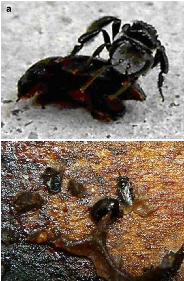
Fig. 1 A T. carbonaria worker mummifies a live small hive beetle by coating it with batumen on the beetle's elytra and legs (a) and visual confirmation of a mummified beetle on the floor of a T. carbonaria hive (b)

respectively. Beetles travelled furthest between time 0 and 5 min and travelled least in colony 1 and furthest in colony 4. At “time” 0 to 5 min the model for diffusion or “random walk” was accepted, \text{Chi}^2=4.12 , p=0.53 (5 min), \text{df}=5 , showing that beetles were able to disperse between 0 and 5 min. At “time” 10 min the model for diffusion or “random walk” was rejected, \text{Chi}^2=24.11 , p<0.001 , showing that beetles were unable to disperse freely between 5 and 10 min. Dissection of the snap frozen hive confirmed positions and batumen coatings which corresponded to previously scanned images (Fig. 2c and d).