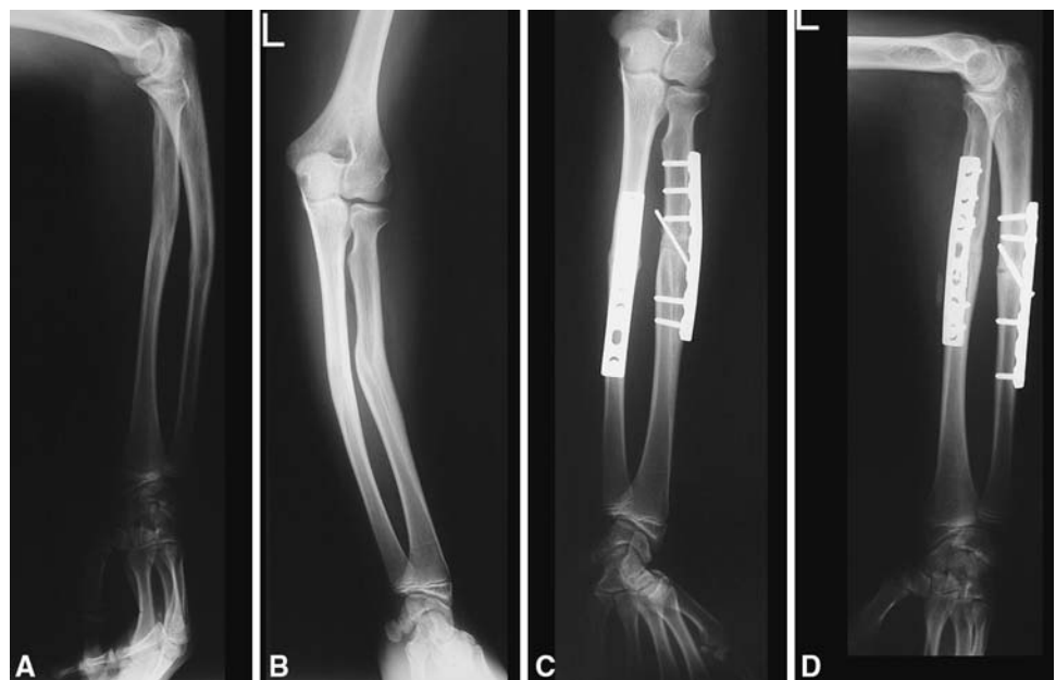
Fig. 2A–D Preoperative (A) anteroposterior and (B) lateral and postoperative (C) anteroposterior and (D) lateral radiographs show the forearm with malunions of the radius and the ulna corrected with osteotomies of both forearm bones (Patient 8).

malunion of the radius. All patients in this group had malunions of the radius located in the distal half of the bone, six of seven were in the distal third.