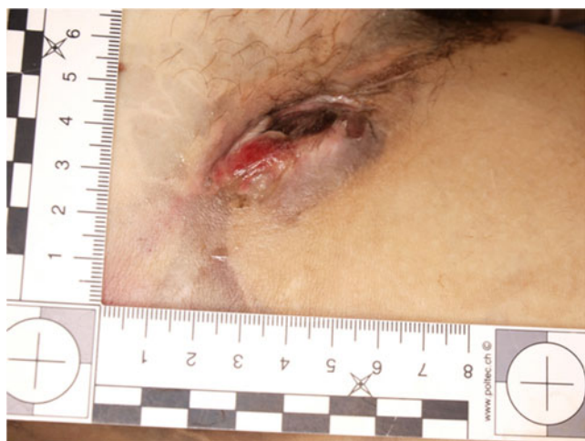
Fig. 1 Large groin wound found on external examination

purulent flow was observed, and a pseudo-aneurysm of the right femoral artery was discovered by Doppler ultrasound. Multiple microemboli of the right leg and foot attributed to probable intra-arterial injections of drugs were observed. The patient was treated with antibiotics over a 3-week period.